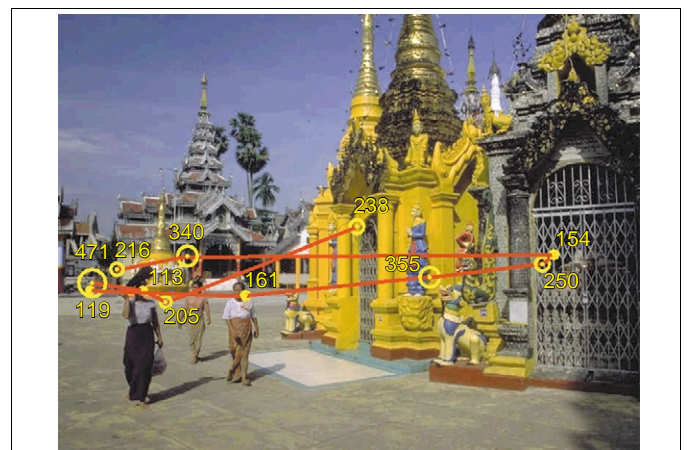
Figure 1. Scan pattern of one viewer during visual search. The viewer was counting the number of people in the scene. The circles represent fixations (scaled in size to their durations, which are shown in milliseconds) and the lines represent saccades. The figure illustrates that fixation durations are variable even for a single viewer examining a single scene.

Early studies of gaze control demonstrated that empty, uniform, and uninformative scene regions are often not fixated. Viewers instead concentrate their fixations, including the very first fixation in a scene, on interesting and informative regions (Box 1 and Figure 3). What