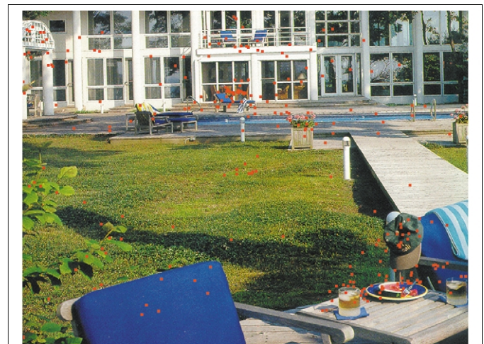
Figure 3. Distribution of fixations over a scene. Representation of all fixations (indicated by red dots) produced by 20 participants viewing a scene in preparation for a later memory test. Note that the fixations are clustered on regions containing objects; relatively homogenous regions of a scene receive few if any fixations.

It may be that one saliency map is computed across the entire scene during the first fixation on that scene, or that a new saliency map is computed in each fixation. In the former approach, the initial map could be used to generate an ordered set of sites that are fixated in turn. This approach assumes that a single map is retained over multiple fixations, an assumption that is suspect given the evidence that metrically precise sensory information about a scene is not retained across saccades [25,26]. The alternative approach is to compute the saliency map anew following each successive fixation. This approach does